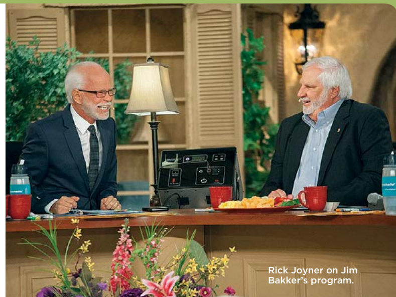
Rick Joyner on Jim Bakker's program.