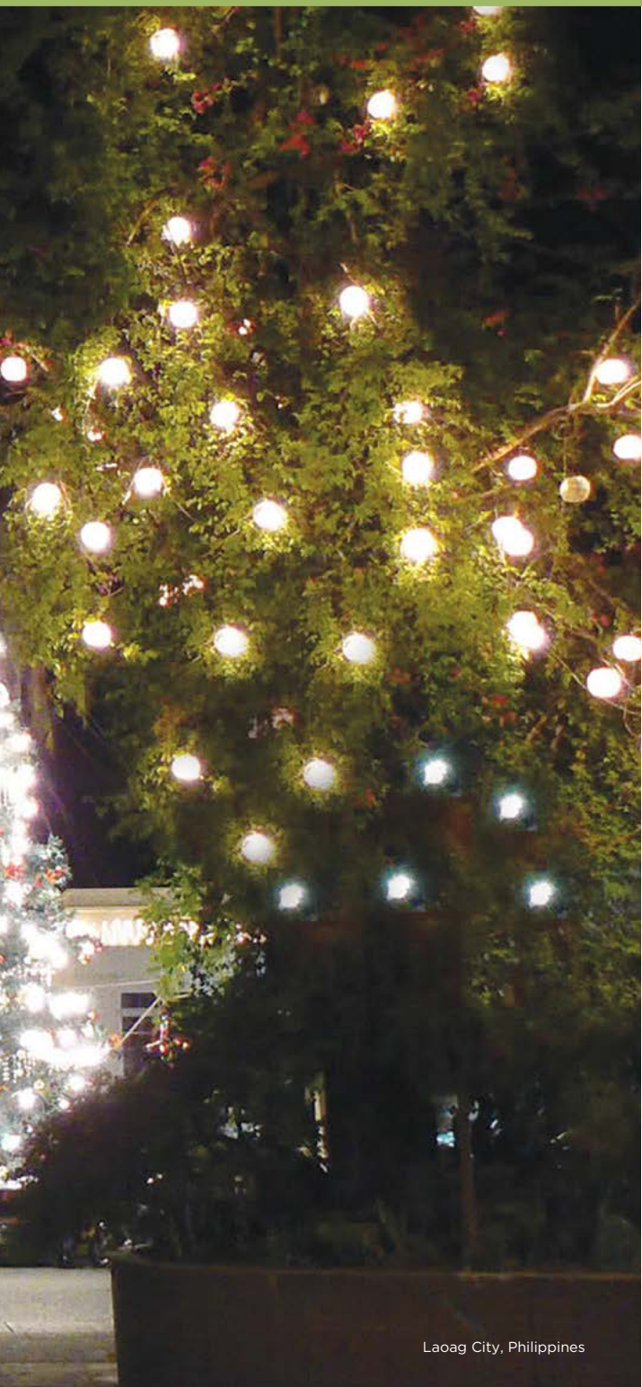
Laoag City, Philippines

“I love to be asked to pray and prophesy to these hungry, young, “sold-out” pastors and even to bare patches of land, as we release destiny and anointing into their lives and their assignments.”